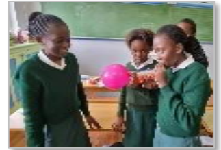
We are constructing the fastest car in the class.