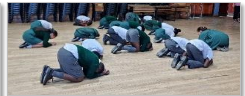
We are seeds waiting to germinate.