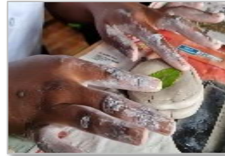
Making fossil imprints of leaves.