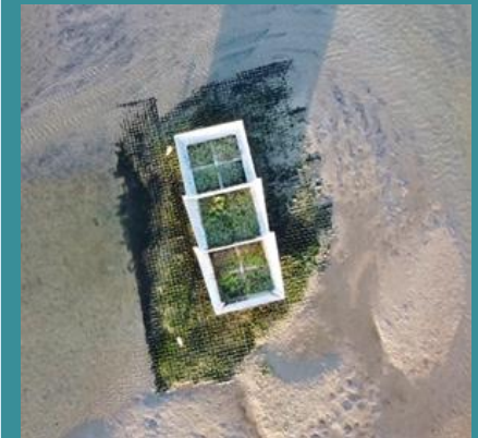
Artificial island in the Wadden sea

The focus of the SFB with the official title "Ecology, Physiology and Molecular Biology of the Roseobacter Clade: Towards a Systems Biology Understanding of a Globally Important Clade of Marine Bacteria" are single-cell organisms with an unusually diverse metabolism, which are an important part of the microbes in