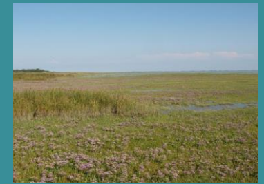
Salt meadow with flowering sea lavender at high tide on the island of Norderney

How is our sea doing? To investigate this question, numerous autonomous diving buoys are drifting through the oceans collecting data. In Oldenburg, researchers are working on the use of artificial intelligence and new types of sensor technology in order to be able to evaluate the amount of data in a more efficient way. [Bundesregierung – 15.10.2021]