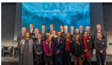
Representatives of DAM member institutions and DAM Executive Board.