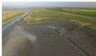
Langwarlder Groden