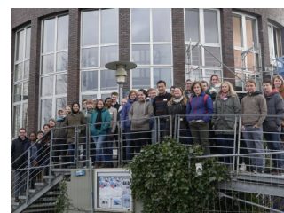
The participants of the ICBM PhD day in front of the Wilhelmshaven ICBM building

The third ICBM PhD day took place at the Wilhelmshaven site of the ICBM on 21 March. The doctoral candidates exchanged experiences and ideas and deepened contacts. For this purpose they also profited from so-called elevator pitches, short talks, typically given in the time span of an elevator ride. As usual in the scientific community, the entire event was held in English.