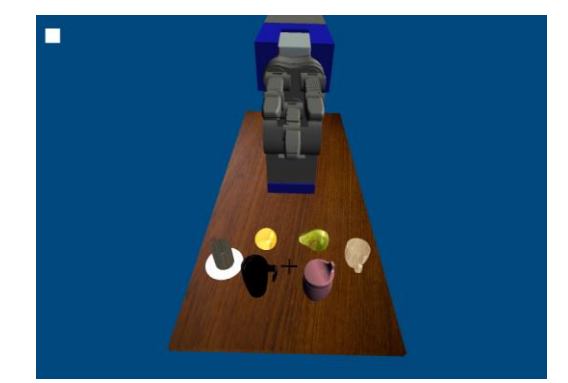
Figure 1: VR scenario used for visual stimulation. This snapshot shows one flash event of an object.

was 8.5°. We defined circular regions on the table which were used i) to stimulate the subjects with visual events by lighting up the object background and ii) to provide cues and feedback by colouring the region's shape. A photo transistor placed on the screen was used to synchronize the ongoing MEG with the events displayed on the screen. To provide realistic feedback, the model of a robot (Mitsubishi RV E2) equipped with a three finger gripper (Schunk SDH) was part of the scene. The virtual robot is designed to mimic actual movements of the real robot. Specifically, an autonomously calculated grasp to the selected object is visualized.