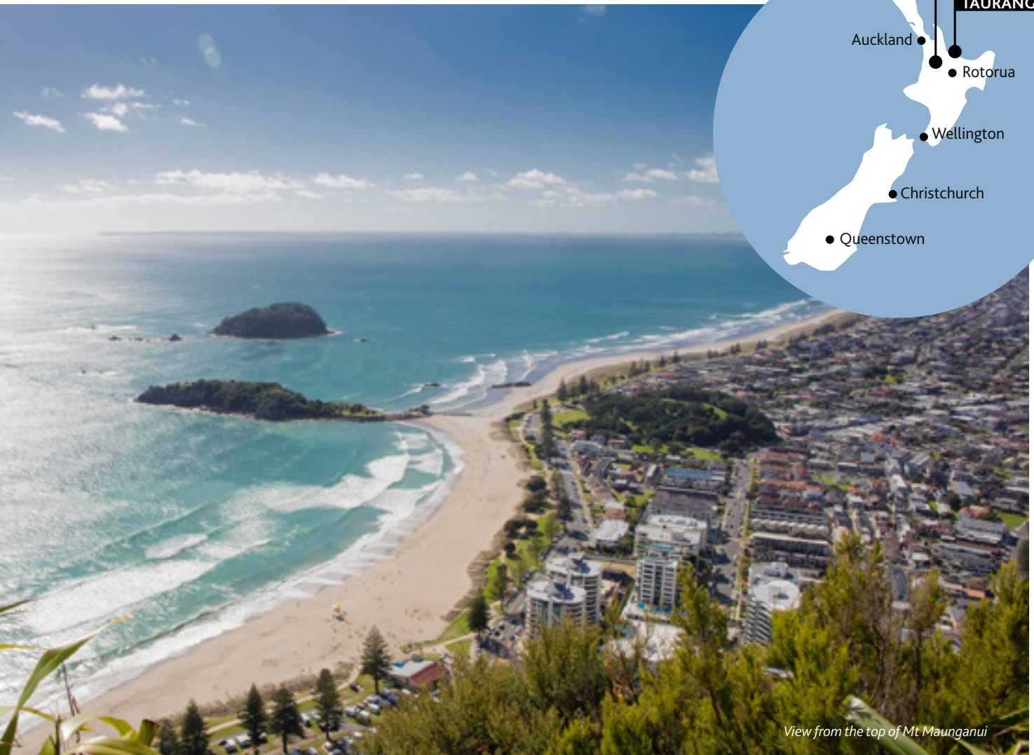
View from the top of Mt Maunganui

Find out more about Tauranga and the Bay of Plenty region at bayofplentynz.com