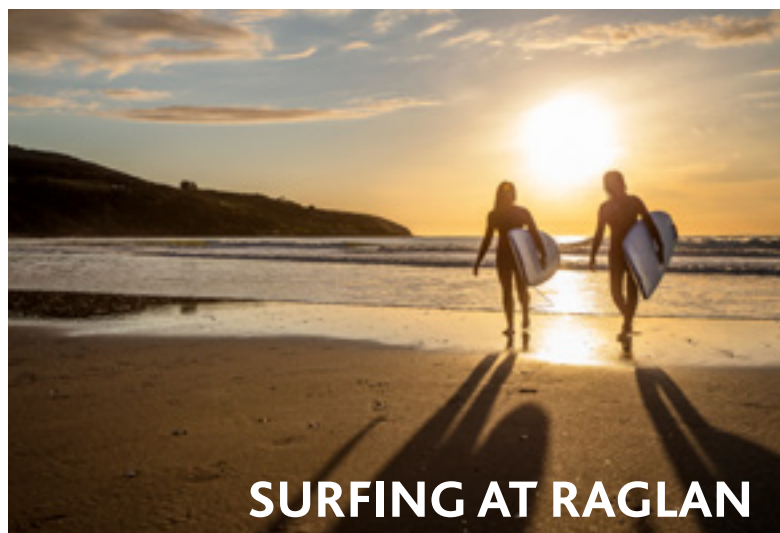
SURFING AT RAGLAN