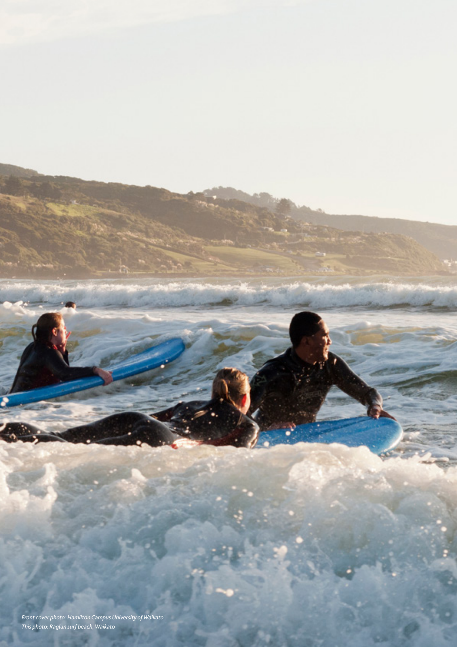
Front cover photo: Hamilton Campus University of Waikato This photo: Raglan surf beach, Waikato