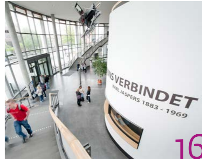
Rethinking the University