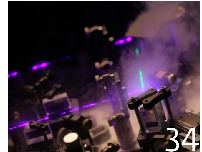
Ultrafast Nano-Optics: The Tiniest of Worlds