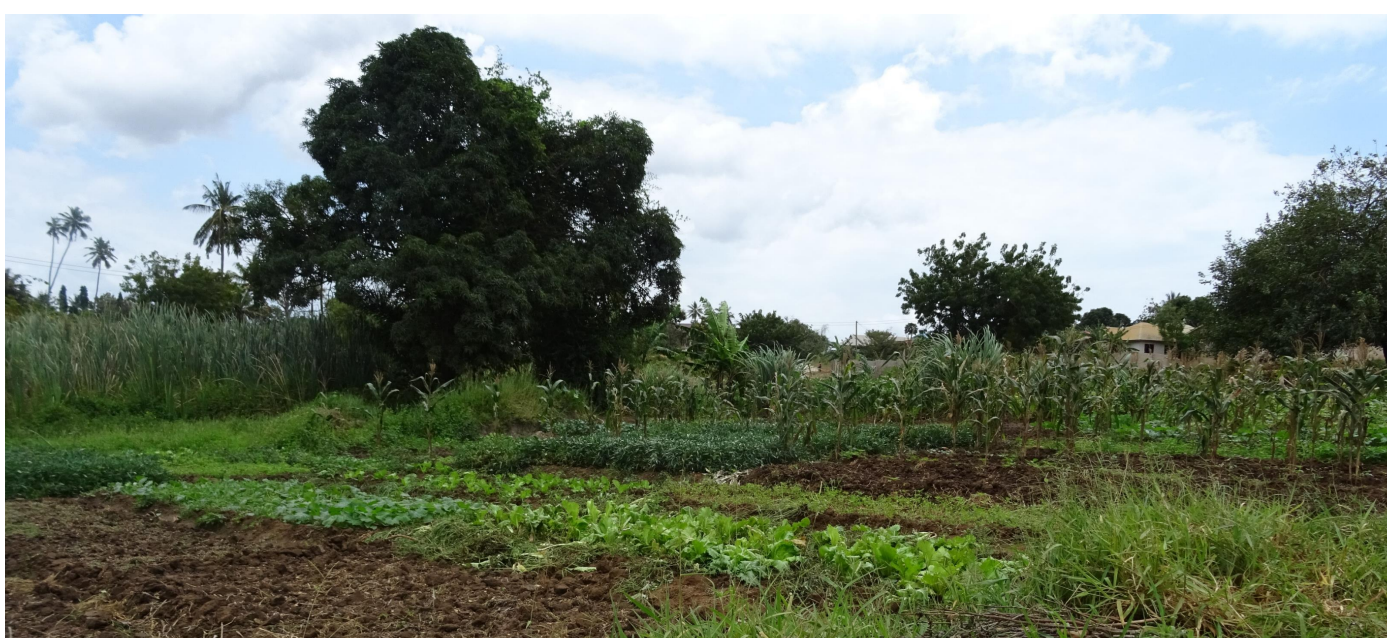
Figure 1: Peri-urban agriculture in the north-west of Dar es Salaam

The close relationship to planning practice as well as the interlinking of research and teaching are of special importance. Through lectures, summer schools and seminars, the project contributes to the improvement of the postgraduate education at the three partnering universities.