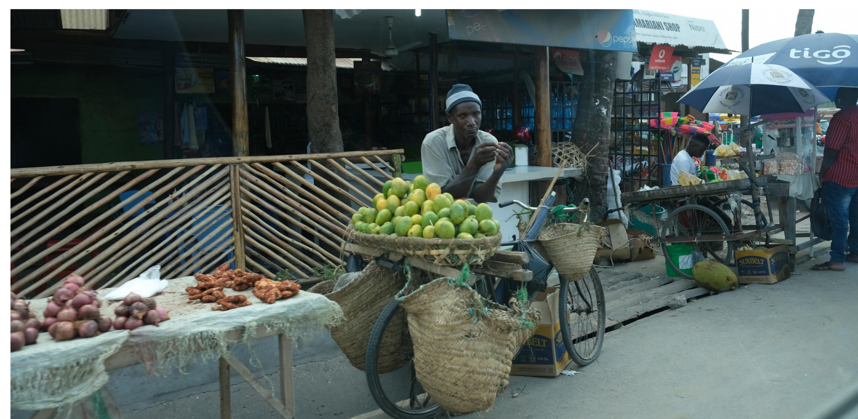
Figure 2: Urban market in Dar es Salaam

The research project supports sustainable agriculture in urban and peri-urban areas in Tanzania and South Africa. Therefore it develops innovative solutions for ecologically sustainable and economically feasible agricultural production. This can help to provide healthy and nutritious food to complement the diets of urban dwellers. Moreover, the integration of green areas in urban planning will make urban structures more resilient towards social, ecological and economic challenges as they foster water restoration, soil retention and formation, air purification, and heat exchange.