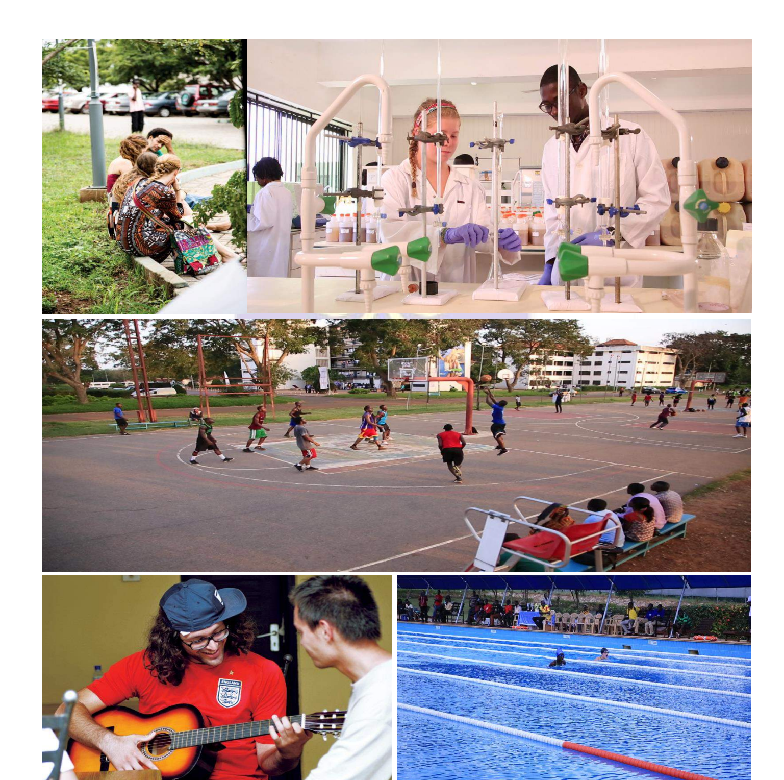
Student life at the University of Ghana includes programmes and events that complement learning and provide diverse opportunities for students to grow academically and personally.