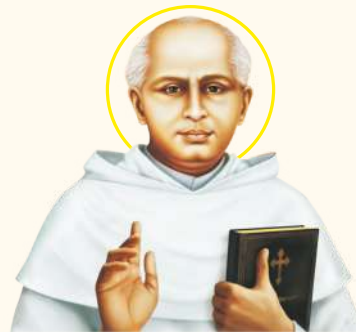
St. Kuriakose Elias Chavara Founder, CMI Congregation

Kristu Jayanti College, founded in 1999, is managed by the 'BODHI NIKETAN TRUST,' formed by the members of St. Joseph Province of the Carmelites of Mary Immaculate (CMI), the first indigenous religious congregation in India. The CMI congregation is the embodiment of the dream and vision of St. Kuriakose Elias Chavara, the founder of the CMI congregation. He was honoured by the Government of India, through the release of a postal stamp with his portrait in 1986. CMI congregation with a membership of 2,300 renders services to humanity in educational, social, healthcare and other areas aiming at the prosperity and well-being of the society. Kristu Jayanti College is a minority Christian Institution. However, it strives to impart quality education without distinction of religion, caste or creed. The institution is reaccredited by NAAC (National Assessment and Accreditation Council) with 'A' Grade.