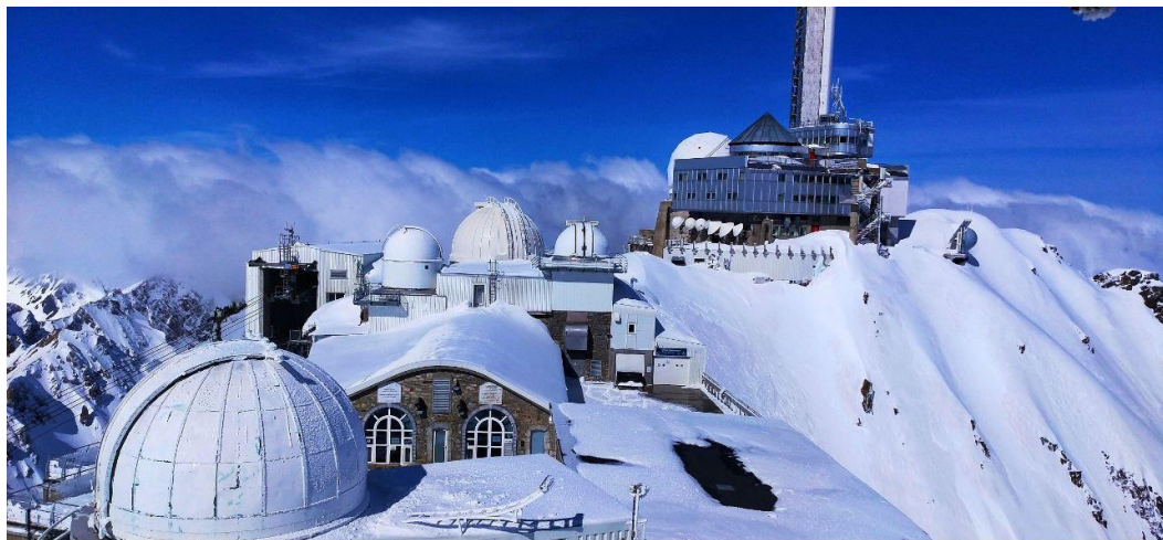
Figure 2. The Pic du Midi Astronomical Observatory