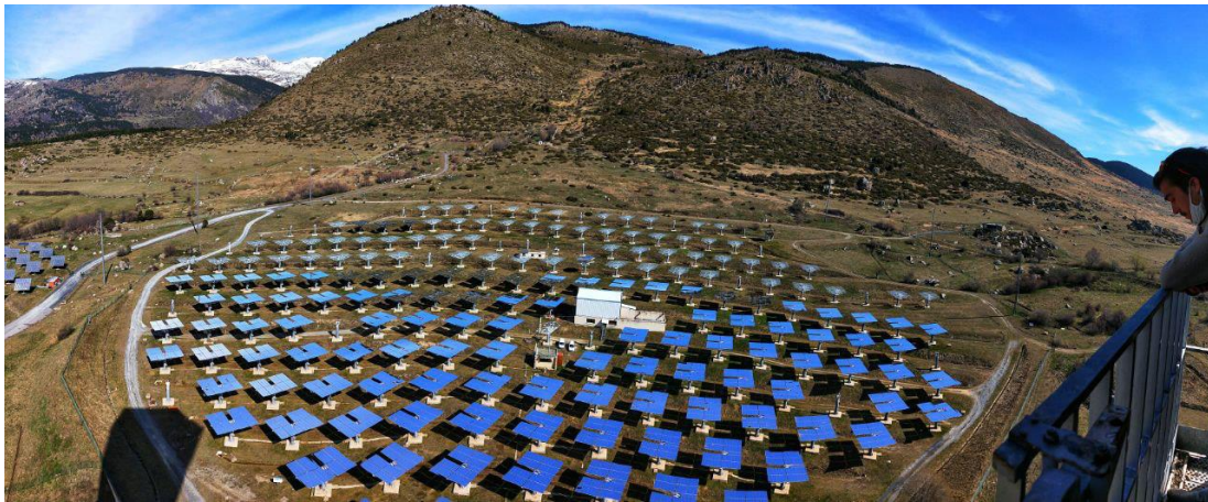
Figure 1. Themis solar plant

was possible to access without any problems, the lectures were always available when we had any question. The way of studying was arranged in a way that we had the possibility to enjoy study abroad and to do the study in an effective way. The industrial visits and labs at University of Perpignan were some my best memories during those periods, also the restaurant food at the institution was very tasty. The credits awarded were 30, as specified for EMRE program, the credit transfer was lucid, understandable, and supported by our coordinator.