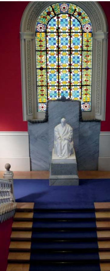
Statue of our Nobel Prize, Santiago Ramón y Cajal