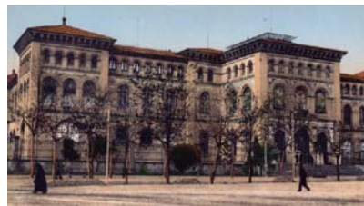
Paraninfo Building. Faculties of Medicine and Sciences (year 1940). Currently, the seat of the Rectorate