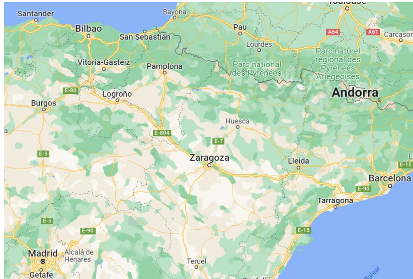
Figure 2. Zaragoza is less than 2 hours away from Barcelona and Madrid

The University's facilities were adequate but depending on your studies, a previously knowledge of Spanish and the systems and programs you might use could play a huge factor in your academic experience. The locals do not speak fluent English in general so you will learn Spanish (at least the basics) in order to get around.