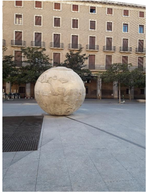
The Globe in Zaragoza.