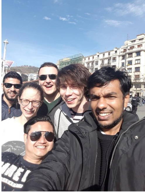
In Basque Country