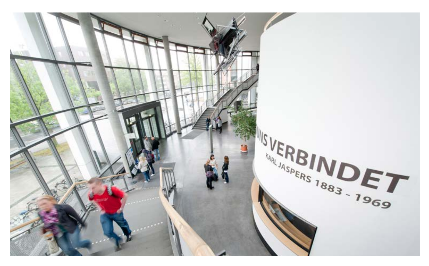
We all have in common that we strive to come closer to the truth": The foyer in the auditorium building.