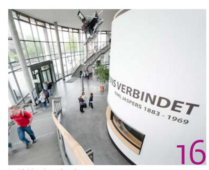
Rethinking the University