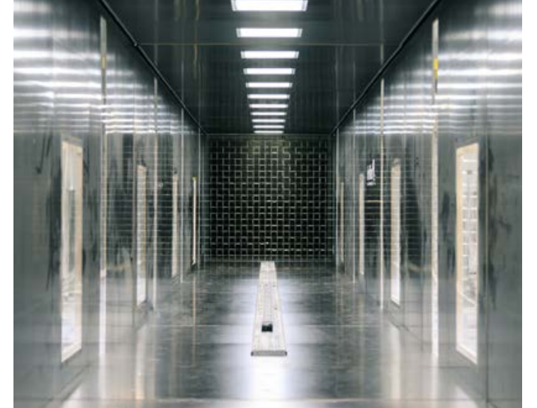
In the NESTEC Emulation Centre at the DLR's Institute of Networked Energy Systems in Oldenburg, scientists can create accurate simulations of complex power grids.