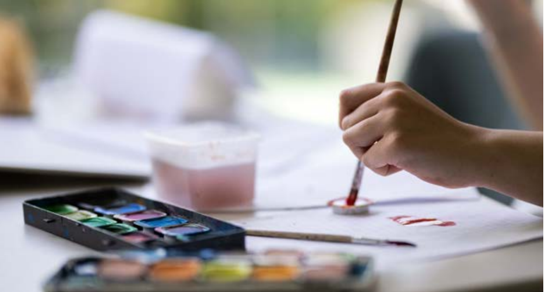
Parents say Primus schools allow their children to experience the joy of learning without the pressures of deadlines and grades and give them the chance to form lasting bonds with other children as well as with teachers.

by the desire to optimise their own performance – irrespective of grades or the desire to achieve a certain school qualification. According to the interviews, this is because many of these children and young adults have understood how important learning and the learning process is for their future: "My future is ahead of me and I still have everything to experience, and if I want a good future I have to learn effectively," one pupil explained. In another still ongoing study, the researchers are following the subsequent educational paths of PRIMUS graduates.