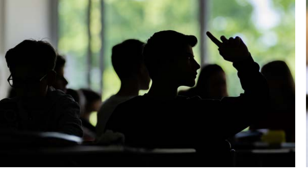
As a general trend, pupils at Primus schools achieved a school qualification that was one level higher than the one previously recommended by their primary school. Forty-eight percent qualified for upper Gymnasium classes – far more than the anticipated nine percent.

multi-tracked school system. This is because in the early years of the experiment three of the five PRIMUS schools enrolled pupils in Year 5 as well as in Year 1. The researchers were thus able to compare the school-type recommendations of 193 pupils who started in Year 5 with the actual secondary school qualifications they went on to actually obtain in 2020. The results: 95 of the students - about half of them had come to one of the PRIMUS schools with a recommendation for the intermediate school type Realschule, another 60 - so almost one third - for the basic Hauptschule. Only 17 - less than one tenth - were recommended to continue their education at a Gymnasium. However, as a report compiled by the researchers for the Ministry of Education states, the general trend was that these pupils "achieved a school qualification which was one level higher than that which they had been recommended to aim for."