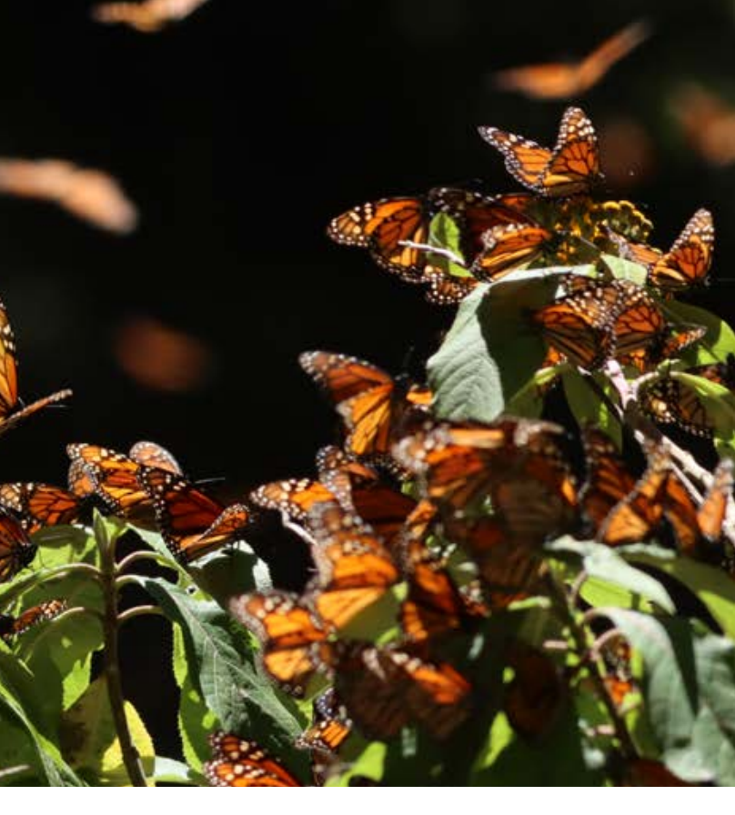
Like the famous monarch butterflies, many insects travel long distances every year on their migrations. As pollinators, these little animals play a big part in agriculture. Our food supply depends on them appearing in the right place at the right time.

sense, which is being researched in detail here in Oldenburg together with researchers from Oxford, also in your own Collaborative Research Centre "Magnetoreception and Navigation in Vertebrates". How does this sensory perception work? Mouritsen: We know that the magnetic sense is light-dependent. We know that birds measure the angle of inclination of the magnetic field lines with respect to the Earth's surface, the so-called magnetic inclination. We know that the magnetic compass is located in the eye and that the information is processed in the part of the brain that deals with visual information. And we