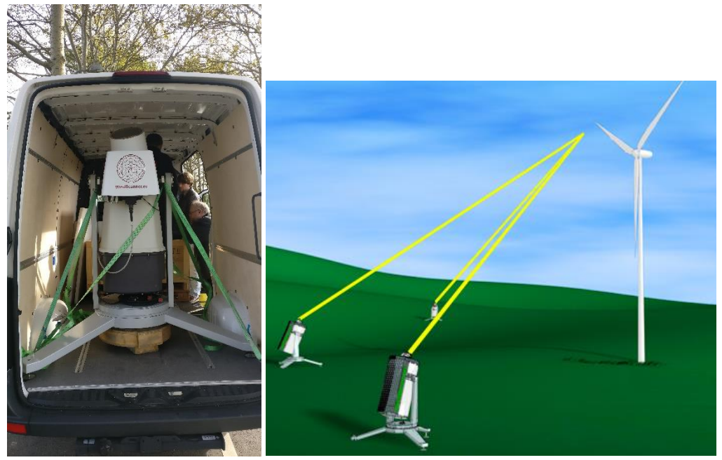
Figure 1: The 6" windscanner obtained by Uni Oldenburg and the setup of 3D wind scanners

As one of the new 6" short range wind scanners were bought by the University of Oldenburg, the exchange period provided an opportunity get acquainted with the device hardware, software and other systems. The exchange period provided an opportunity to work with measurement data from previous experiments conducted at DTU with the wind scanners. I was able to gain familiarity and know how on the short range wind scanners aided by the experienced personnel at DTU. As I will be working with data from these devices during the course of my PhD, the experience was very helpful.